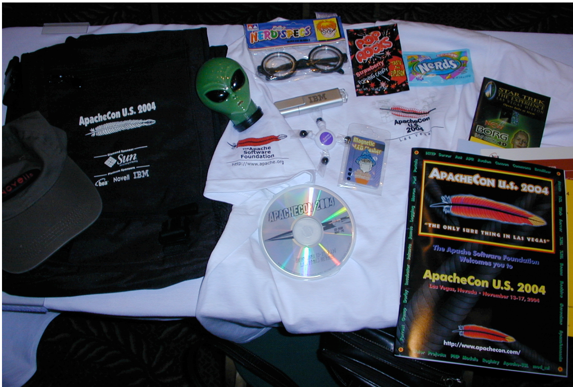
Figure 2. ApacheCon conference “swag”: Alien head, pop bottle eyeglasses.