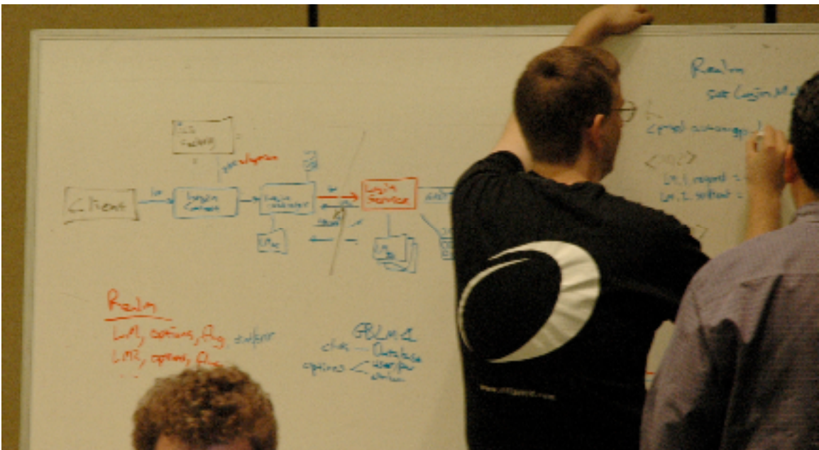
Figure 6. Design work at a whiteboard.