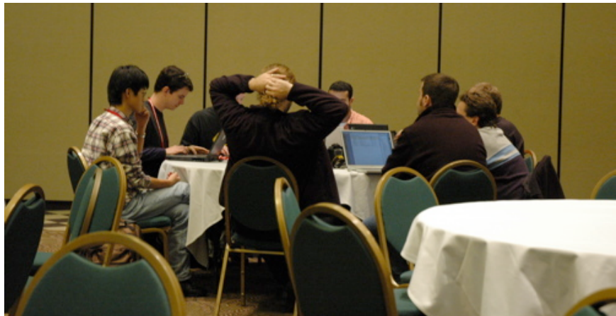
Figure 4. ApacheCon hack-a-thon.