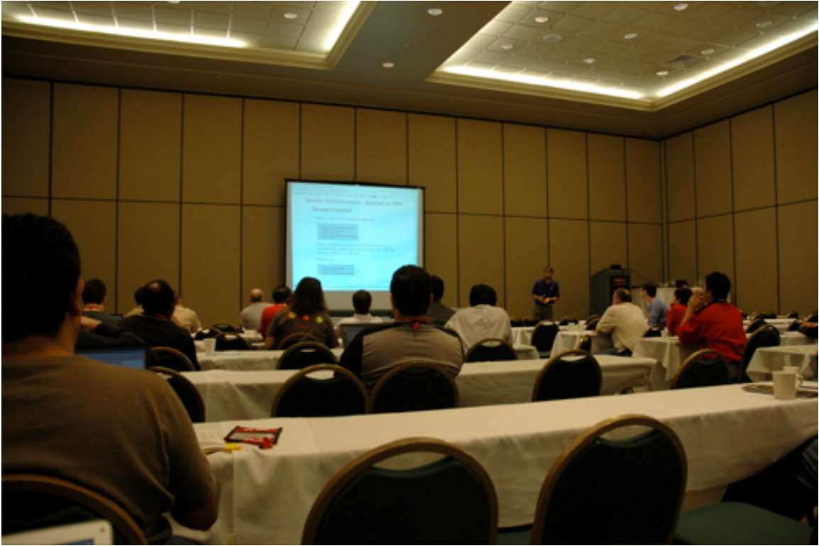
Figure 5. ApacheCon paper presentation.