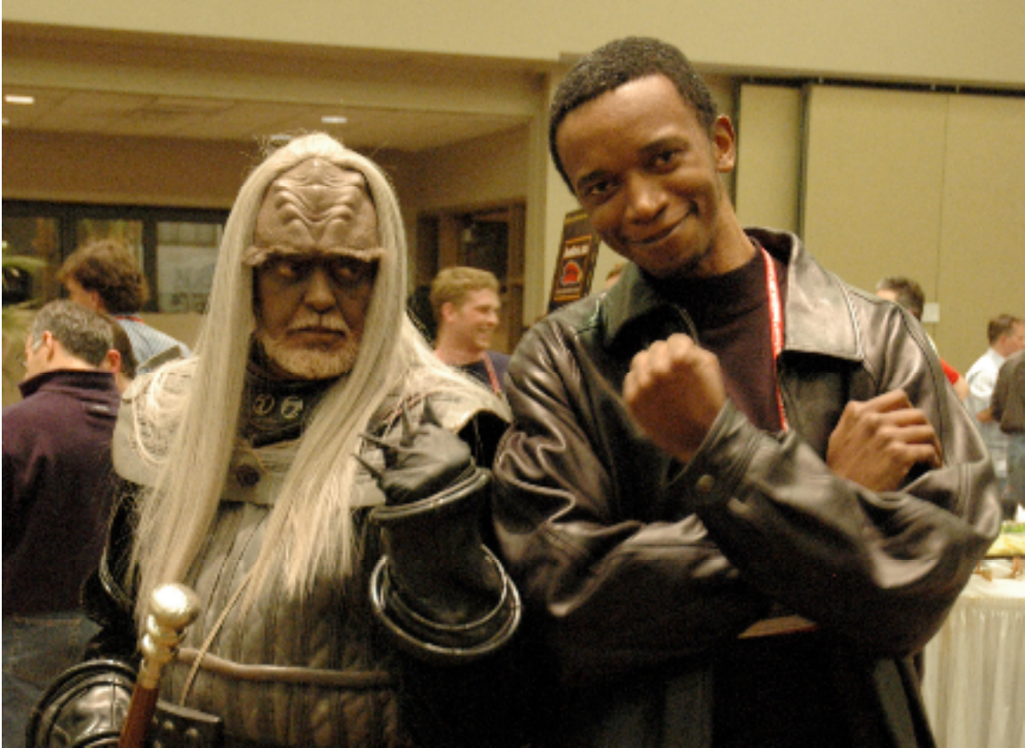
Figure 3. ApacheCon reception included appearances by Star Trek characters.