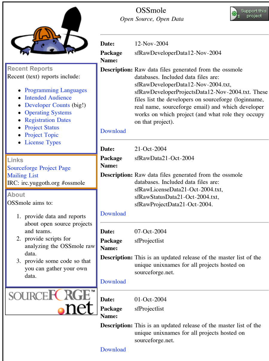
Figure 2: The OSSmole sourceforge homepage showing the basic reports currently generated from the database.